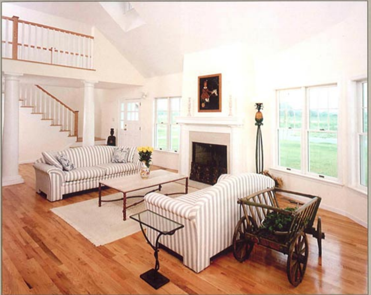
The living room is a dynamic two-story space, with a curving glass wall and crisp details.